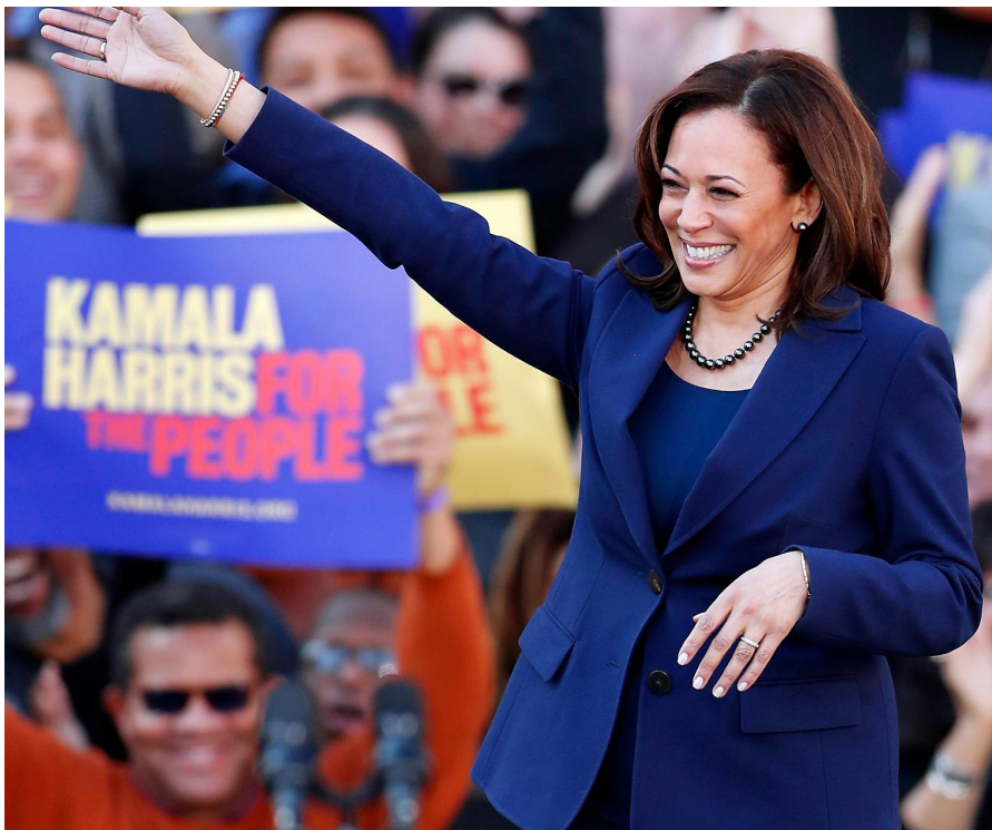
Vice President Kamala Harris in Oakland, CA

On January 17, Oakland Symphony and its partners in the arts and cultural community of Oakland presented "Oakland Salutes Madame Vice President: A Virtual Inaugural Ball & Hometown Celebration." More than 5,000 households viewed this event on YouTube and Facebook Live that day with thousands more watching since then.