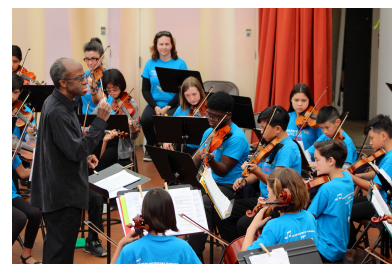
MUSE Fairyland Concert 2019

You are keeping music education in MUSE students' lives.